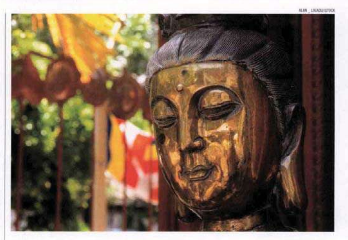
Buddha awaits Gangaramaya Temple, Colombo, above

Journey to La Digue to take a leisurely bike ride through the picturesque roads of the island to reach Anse Source d'Argent, allegedly the most photographed beach in the world with its distinctive rocks and pure white sand. Then on your way back to the ferry, stop off at Fish Trap Restaurant & Bar to