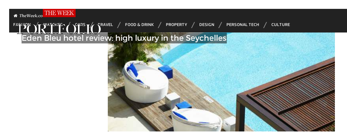
CHARLOTTE FLACH / MAY 4, 2018 / TRAVEL